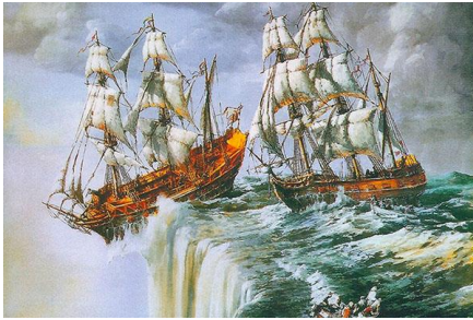
Is the world 'flat' ...

Department of Sociology and Social Work University of Wisconsin-Stevens Point